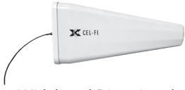
Wideband Directional Antenna