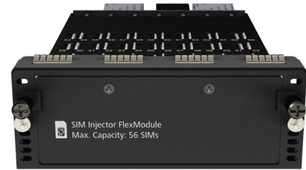
SIM Injector FlexModule (EXM-SIM-BK56)