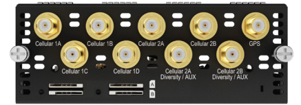
1x LTE-A Pro Module (CAT-18), 1x 5G Module(CAT-20)