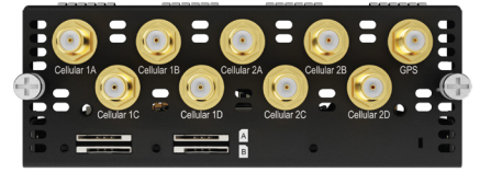
2x 5G Module (CAT-20)