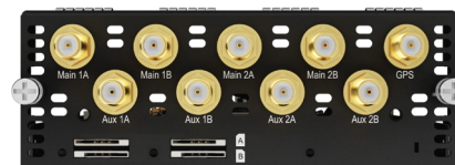
2x LTE-A Pro Module (CAT-18)