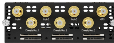
3x LTE-A Module (EXM-3LTEA)