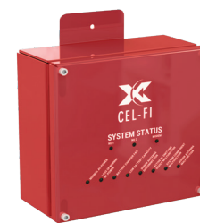
Remote Annunciator Panel (RA)

The Cel-Fi RED Remote Annunciator Panel (RA) provides automatic supervisory signals for malfunctions of Cel-Fi ERCES public safety solutions. In addition to being NEMA 4 rated and complying with NFPA and IFC fire codes, the RA features PoE architecture for quick installation and alarm configuration with Cel-Fi QUATRA RED or SOLO RED installations. The RA also offers real-time component monitoring through the Cel-Fi WAVE Portal.