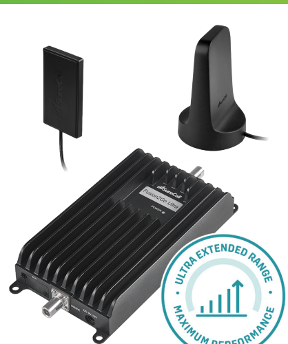
The highest uplink power on the market helps you stay connected with distant cell towers.